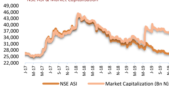
NSE ASI & Market Capitalisation

The NSE All Share Index moderated further by 2 bps amid sustained bearish activity even as the Exchange printed 18 losers as against 15 gainers at the close of business. Amongst the worst hit stocks were JBERGER, FLOURMILL, WAPCO and ZENITHBAK as investors sold part of their holdings to book profit following the stocks' recent price appreciation. Hence, the year to date gain of NSE ASI moderated to 9.75% from 9.76%. Nevertheless, we observed a slowdown in profit taking as most of the sub-sectored closed in green: NSE Banking, NSE Industrial, NSE Oil/Gas and NSE Industrial indices by 0.13%, 0.86%, 0.36% and 0.41% respectively. Meanwhile, the total value of stocks traded fell by 1.97% to N3.64 billion. Elsewhere, NIBOR moderated for all tenor buckets amid sustained financial liquidity ease; also, NITTY moderated for most maturities on renewed bullish activity. In the bonds market, the values of OTC FGN bonds moved in mixed directions across maturities.